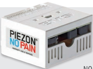
NO PAIN Module