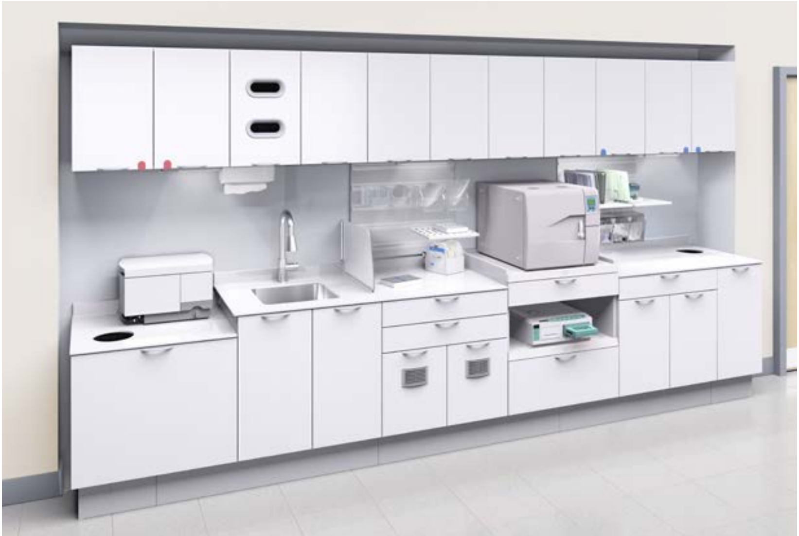
An efficient, systematic sterilization center helps maintain a safe practice—and saves valuable time.