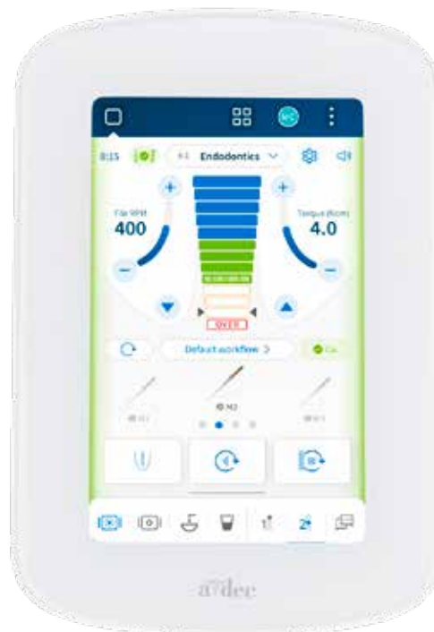
Get real-time guidance as you approach the apex with clear step tracking and performance metrics. (Interface as shown on A-dec 500 Pro DS7 screen.)