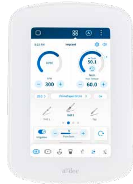
Touchscreen shows you real-time RPM, torque, and irrigation monitoring with preset workflows.