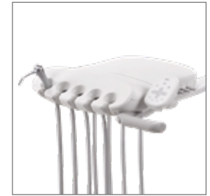
A-dec 300 delivery system