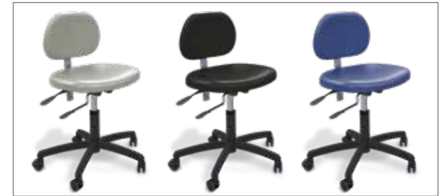
Performer eVo doctor's stool