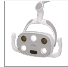
Performer eVo LED light