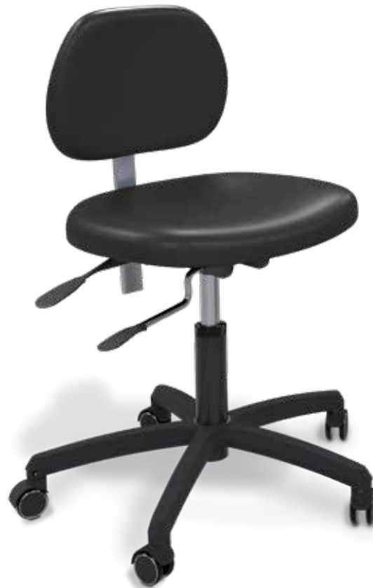
Performer eVo doctor's stool