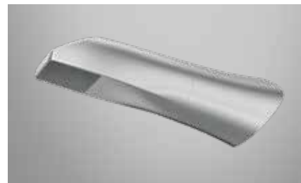
Steel sleeve with sapphire glass window